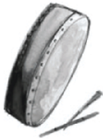
Bodhrán/Vocal/Electric Kick (1 x XLR, 1 x SM58, 1 x DI) (1 x Tall)