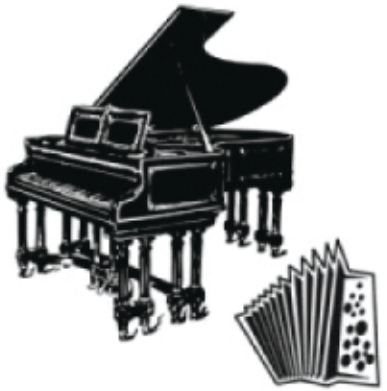
Piano/Piano Accordion/Vocal (2 x DI, 1 x SM57, 1 x SM58) (2 x Tall Boom Stands)